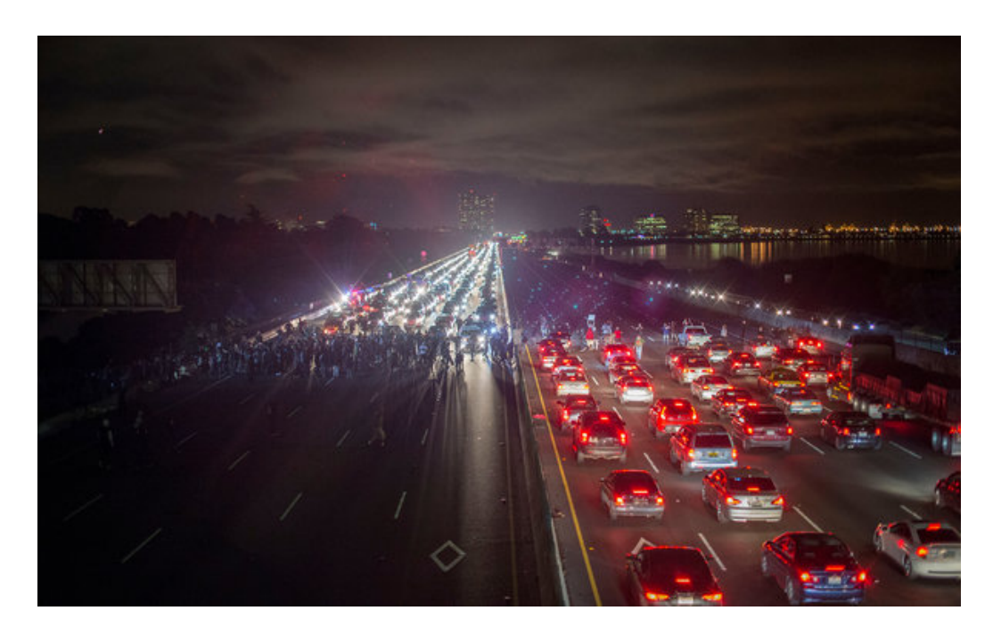
A protest on Monday night against police violence blocked traffic in both directions of Interstate 80 in Berkeley, Calif.

sense that this would either be the end or that something would happen." "So we came back to campus," he said. "We do not approve of violence."